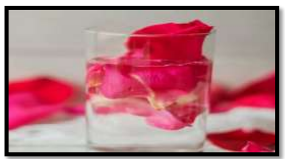
Fig 11: Rose water

Biological source: Obtained from petals of Rosa damascene. Family: Rosaceae Uses: Hydrating, maintains skin pH balance and remove unwanted spots.