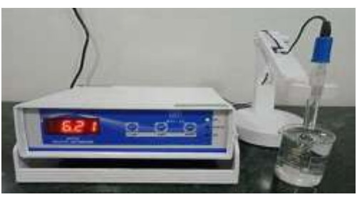
Fig 13: Digital pH meter

6.3 Washability: After applying a tiny amount of gel to the hand, it was washed with tap water, observe its wash ability.