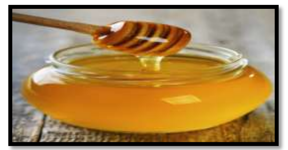
Fig 9: Honey

Uses :Honey is used to hydrate skin, reduce wrinkles [10] and acts as moisturizer.